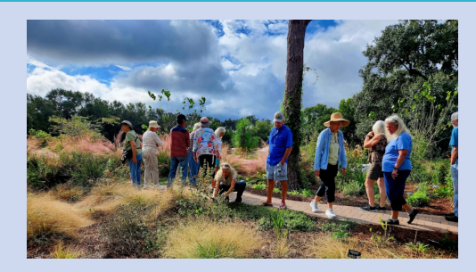
The Wildflower Garden Committee hosted the Nature Coast Florida Native Plant Society Field Trip at VISTA Gardens