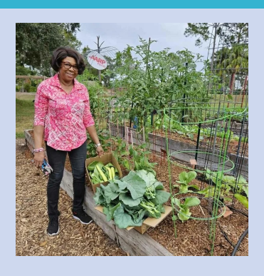
AARP's first 5 lb harvest for the Community Food Pantry. A second harvest yielded 28 lbs of donated produce.